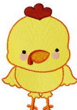
Name: bc_OnTheFarm3_4Inch File: bc_OnTheFarm3_4Inch.PES Stitches: 11603 Colors: 8/8 Size: 2.69x3.82 " Stops: 7