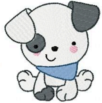
Name: bc_OnTheFarm6_3Inch File: bc_OnTheFarm6_3Inch.PES Stitches: 11382 Colors: 7/9 Size: 2.88x3.00 " Stops: 8