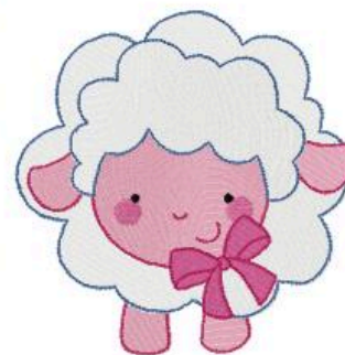
Name: bc_OnTheFarm10_5Inch File: bc_OnTheFarm10_5Inch.PES Stitches: 28762 Colors: 6/10 Size: 4.94x5.01 " Stops: 9