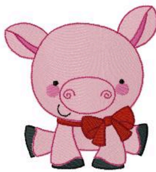
Name: bc_OnTheFarm8_5Inch File: bc_OnTheFarm8_5Inch.PES Stitches: 27471 Colors: 7/13 Size: 4.69x5.00 " Stops: 12