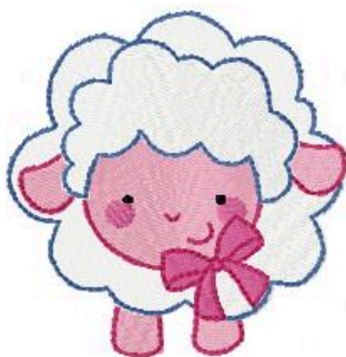
Name: bc_OnTheFarm10_3Inch File: bc_OnTheFarm10_3Inch.PES Stitches: 12741 Colors: 6/10 Size: 2.98x3.01 " Stops: 9