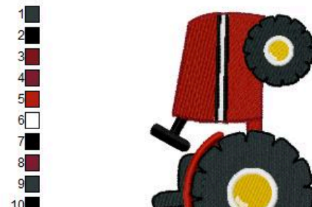
Name: bc_OnTheFarm13_5Inch File: bc_OnTheFarm13_5Inch.PES Stitches: 19600 Colors: 7/12 Size: 3.39x5.05 " Stops: 11