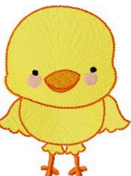
Name: bc_OnTheFarm4_4Inch File: bc_OnTheFarm4_4Inch.PES Stitches: 12848 Colors: 6/6 Size: 2.98x3.82 " Stops: 5