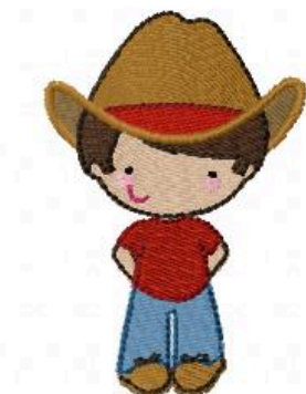
Name: bc_OnTheFarm12_3Inch File: bc_OnTheFarm12_3Inch.PES Stitches: 7500 Colors: 12/14 Size: 2.04x3.00 " Stops: 13