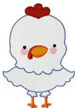
Name: bc_OnTheFarm2_5Inch File: bc_OnTheFarm2_5Inch.PES Stitches: 17977 Colors: 9/9 Size: 3.42x5.01 " Stops: 8