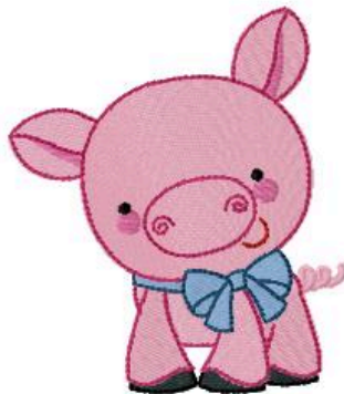
Name: bc_OnTheFarm1_4Inch File: bc_OnTheFarm1_4Inch.PES Stitches: 13657 Colors: 8/13 Size: 3.37x3.82 " Stops: 12