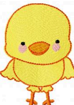
Name: bc_OnTheFarm4_3Inch File: bc_OnTheFarm4_3Inch.PES Stitches: 8602 Colors: 6/6 Size: 2.35x3.00 " Stops: 5