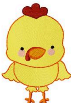
Name: bc_OnTheFarm3_5Inch File: bc_OnTheFarm3_5Inch.PES Stitches: 18314 Colors: 8/8 Size: 3.51x5.00 " Stops: 7