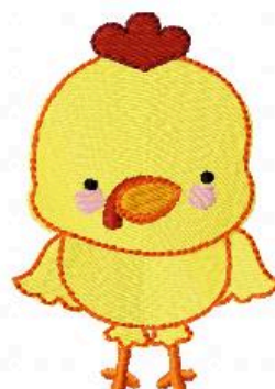
Name: bc_OnTheFarm3_3Inch File: bc_OnTheFarm3_3Inch.PES Stitches: 7816 Colors: 8/8 Size: 2.11x3.00 " Stops: 7