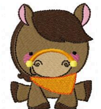
Name: bc_OnTheFarm9_3Inch File: bc_OnTheFarm9_3Inch.PES Stitches: 9232 Colors: 10/11 Size: 2.04x2.65 " Stops: 10