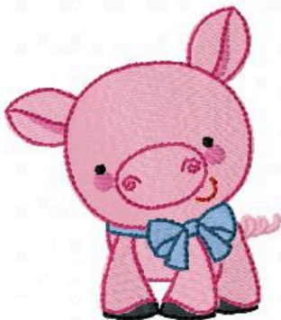
Name: bc_OnTheFarm1_3Inch File: bc_OnTheFarm1_3Inch.PES Stitches: 9396 Colors: 8/13 Size: 2.65x3.00 " Stops: 12