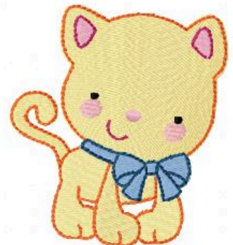
Name: bc_OnTheFarm7_3Inch File: bc_OnTheFarm7_3Inch.PES Stitches: 11213 Colors: 7/7 Size: 2.72x3.00 " Stops: 6