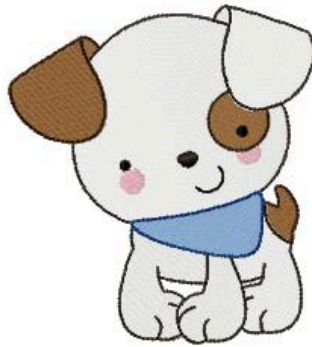
Name: bc_OnTheFarm5_5Inch File: bc_OnTheFarm5_5Inch.PES Stitches: 24797 Colors: 7/9 Size: 4.54x5.00 " Stops: 8