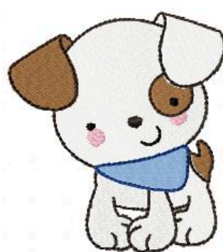
Name: bc_OnTheFarm5_3Inch File: bc_OnTheFarm5_3Inch.PES Stitches: 10504 Colors: 7/9 Size: 2.74x3.01 " Stops: 8