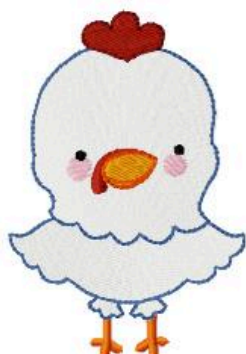
Name: bc_OnTheFarm2_4Inch File: bc_OnTheFarm2_4Inch.PES Stitches: 11380 Colors: 9/9 Size: 2.62x3.82 " Stops: 8