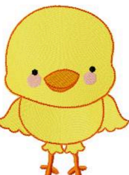
Name: bc_OnTheFarm4_5Inch File: bc_OnTheFarm4_5Inch.PES Stitches: 20639 Colors: 6/6 Size: 3.90x5.00 " Stops: 5