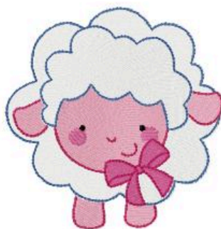
Name: bc_OnTheFarm10_4Inch File: bc_OnTheFarm10_4Inch.PES Stitches: 18535 Colors: 6/10 Size: 3.78x3.83 " Stops: 9