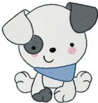
Name: bc_OnTheFarm6_4Inch File: bc_OnTheFarm6_4Inch.PES Stitches: 16994 Colors: 7/9 Size: 3.66x3.82 " Stops: 8