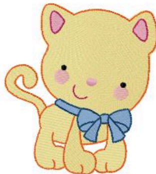
Name: bc_OnTheFarm7_5Inch File: bc_OnTheFarm7_5Inch.PES Stitches: 25530 Colors: 7/7 Size: 4.52x5.00 " Stops: 6