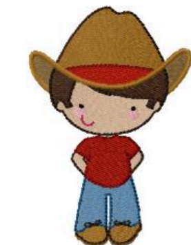
Name: bc_OnTheFarm12_4Inch File: bc_OnTheFarm12_4Inch.PES Stitches: 10646 Colors: 12/14 Size: 2.59x3.82 " Stops: 13