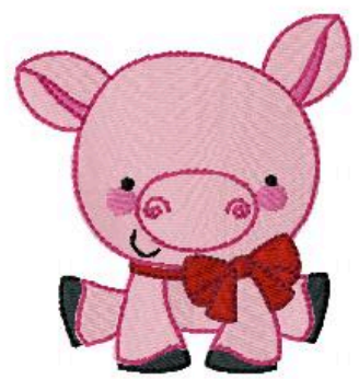
Name: bc_OnTheFarm8_3Inch File: bc_OnTheFarm8_3Inch.PES Stitches: 12004 Colors: 7/13 Size: 2.83x3.00 " Stops: 12