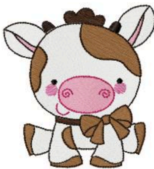
Name: bc_OnTheFarm11_4Inch File: bc_OnTheFarm11_4Inch.PES Stitches: 19244 Colors: 8/13 Size: 3.58x3.82 " Stops: 12