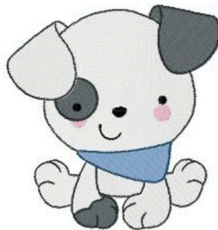
Name: bc_OnTheFarm6_5Inch File: bc_OnTheFarm6_5Inch.PES Stitches: 26951 Colors: 7/9 Size: 4.78x5.00 " Stops: 8