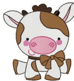
Name: bc_OnTheFarm11_5Inch File: bc_OnTheFarm11_5Inch.PES Stitches: 29443 Colors: 8/13 Size: 4.68x5.00 " Stops: 12