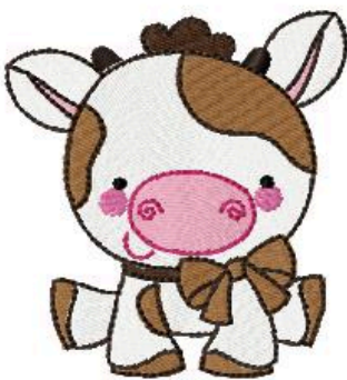
Name: bc_OnTheFarm11_3Inch File: bc_OnTheFarm11_3Inch.PES Stitches: 13401 Colors: 8/13 Size: 2.81x3.00 " Stops: 12