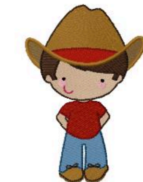
Name: bc_OnTheFarm12_5Inch File: bc_OnTheFarm12_5Inch.PES Stitches: 16002 Colors: 12/14 Size: 3.39x5.00 " Stops: 13